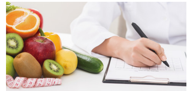
Nutrition consultation by a professional dietician [Personalized healthy meal provided by designated chef]